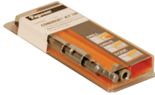
Condrive Drill Driver Installation Kit