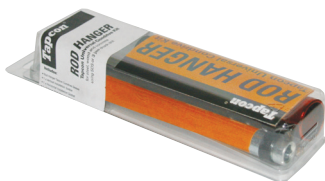
Universal Condrive Kit