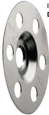
Insulation disc DTM-A4