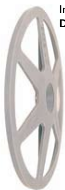
Insulation disc DT